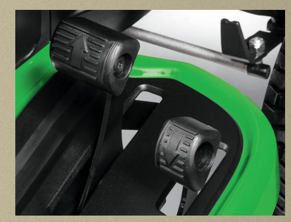
Side-by-side pedals. Lets you easily change from forward to reverse with two-pedal foot control for effortless speed and direction changes.