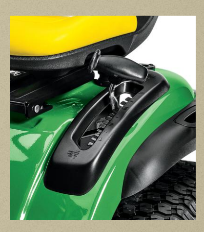
The redesigned mower deck lift lever. Minimizes effort. The ¼-in. (0.64-cm) height-ofcut increment adjustment is as precise as ever.