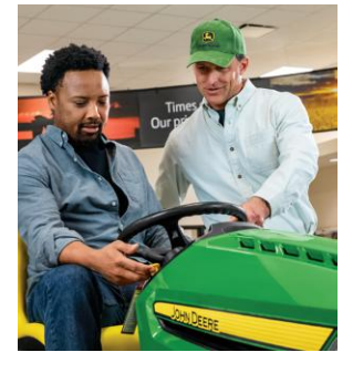
RIGHT WITH YOU. YOUR JOHN DEERE DEALER.

Committed turf experts dig into what you need. Factory-trained service and parts professionals ensure that your equipment keeps working as hard as you do. So, let's get to work, together.