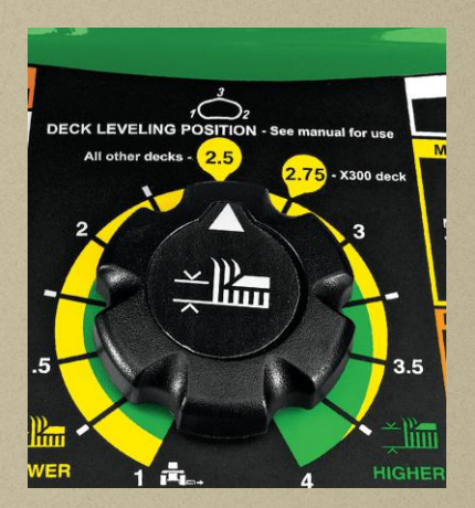
Cutting Height Adjuster. Cutting height can be adjusted in ¼-in. (0.64-cm) increments for a precise, even cut. (Shown here on the X300 Series.)