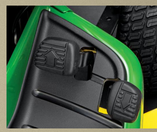
Twin Touch System. Twin Touch" automatic transmission lets you easily change from forward to reverse with two-pedal foot control for effortless speed and direction changes. (Available on Select Series Tractors.)