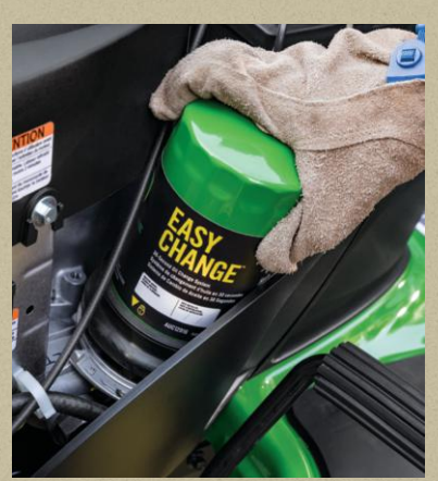
John Deere Easy Change™ 30-Second Oil Change System. We've changed the oil change, so anyone can do it. No mess. No fuss. No problem. The oil and oil filter are all-in-one.* Twist. Lock. Done. It's that easy.